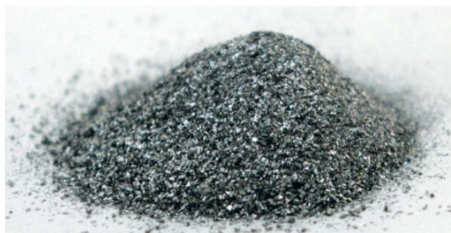
Fig. 1 Mg alloy as flakes for H 2 storage

The in situ exploration of hydrogen uptake and release pathways with neutrons allows optimisation of the composition of new materials.