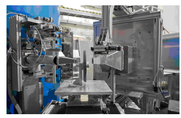
Fig. 1 The Stress-Spec instrument at FRM II in Garching, Germany. Slit-system for residual stress analysis.

On this specific example, the stress profiles for the 3 principal directions indicate that the overall stress distribution is quite smooth in terms of intensity and direction. The result, in combination with other measurements, assesses the quality of the brazing process.